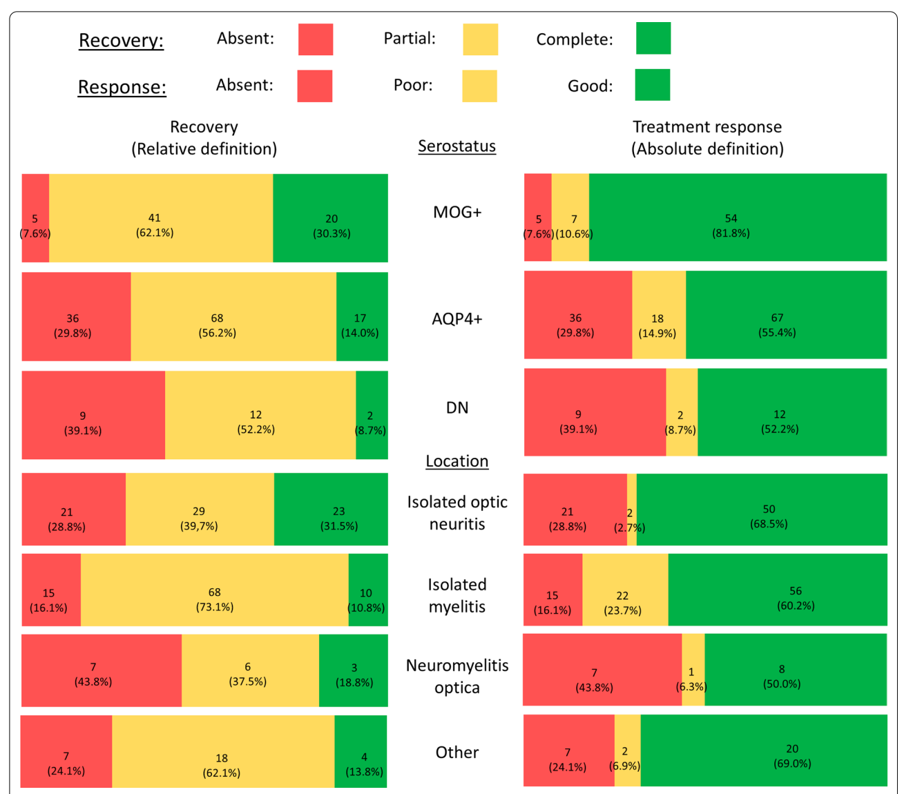
Fig. 3 6-Month clinical outcome, presented as bar plots. We classified the recovery as "complete", "partial", or "absent" using a relative and an absolute definition. The relative definition was that proposed by Kleiter et al. [17], classifying the recovery as "complete" if the 6-month EDSS score reached the score before the attack, "partial" if recovery was incomplete, and "absent" if there was no improvement or a clinical deterioration. The absolute definition described the treatment response, based on the EDSS improvement at 6 months, classifying the response as "good" if the 6-month EDSS score showed a decrease of ≥ 1 point in the case of nadir EDSS score ≤ 3 or a reduction of ≥ 2 points in the case of a nadir EDSS score > 3. Treatment response was classified as "poor" if the EDSS score decrease was slighter and as "absent" if the EDSS score remained unchanged or if it worsened. Counts and percentages are shown for each bar. AQP4+: NMOSD-AQP4+; MOG+: NMOSD-MOG+; DN: NMOSD-DN (double seronegative)

Demuth et al. Journal of Neuroinflammation